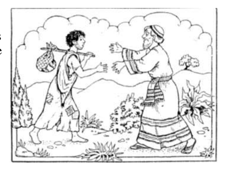
The Prodigal Son

more instructive principles, or lessons, or (sometimes) a normative principle. It differs from a fable in that fables use animals, plants, inanimate objects, and forces of nature as characters, while parables generally feature human characters. It is a type of analogy.