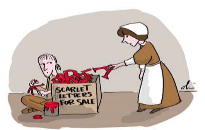
"I'd like to exchange this for another letter, please. This one just isn't working out for me."

Discuss how letters and others symbols have been used on clothing throughout history to make a statement about the person wearing them (i.e. the "letter sweater" for athletes, the Star of David used to denote Jewish ancestry during the Holocaust). How is it that the same symbols used to separate us can also be used to celebrate us?